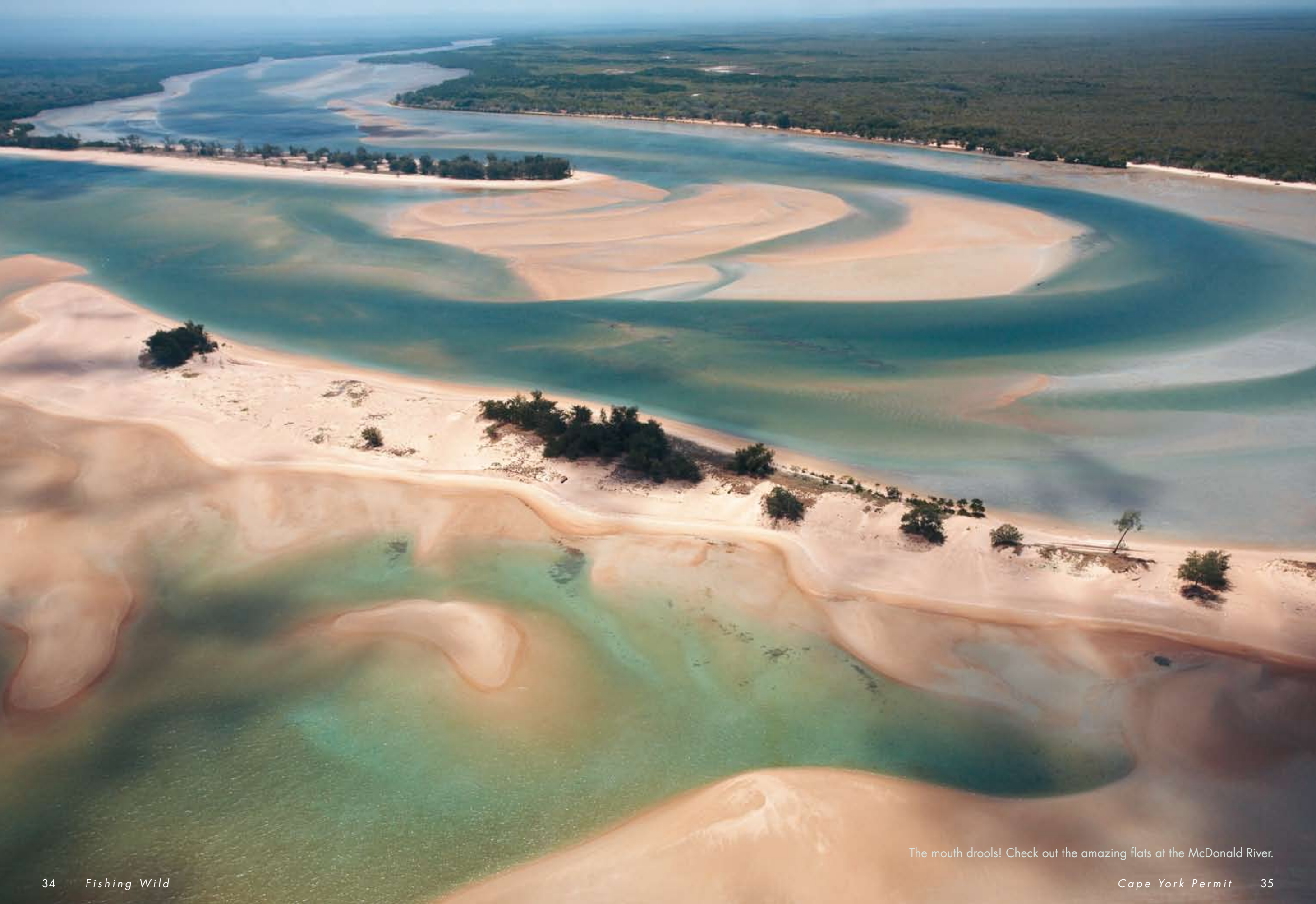
The mouth drools! Check out the amazing flats at the McDonald River.