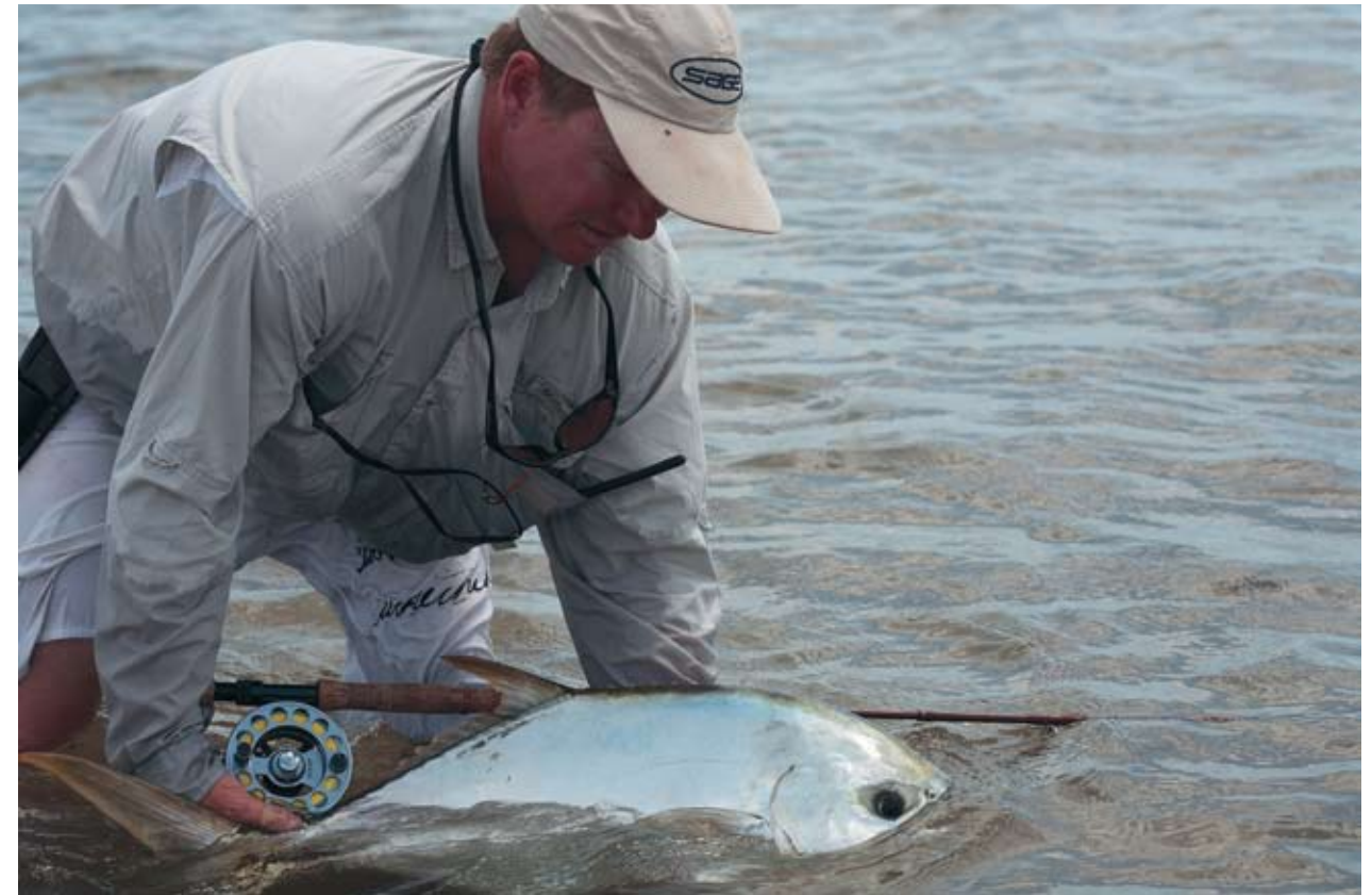
This fish was caught in very shallow water. There were scattered fish on the rim of a deeper gutter and they were tailing steadily in only 50 cms of water and it pounced on a suspender crab.

moving mass of the school without relying on the mooning.