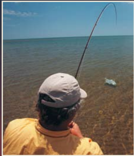
The closing stages are always fraught with nervousness. It pays to work these fish over using constant angle changes.