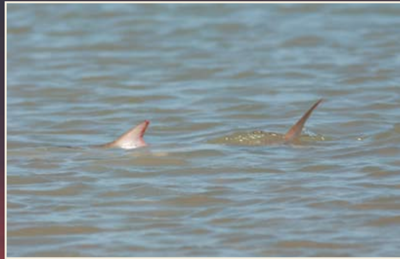
This free swimming permit was spotted cruising the beach between the Pennfather River and Janies Creek. At first we thought it was a shark then when I went to take pics through the long lens I saw immediately that it was a permit. I'd set out that morning on a

We fished flies dead and with a slow retrieve through the mass. We fished crabs and we fished shrimps. We fished with flies that had worked in the past and we tried outrageous looking things more in hope than anything else.