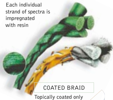
COATED BRAID Typically coated only

Each individual strand of spectra is impregnated with resin